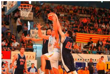
Friendly USAAI vs. Ireland